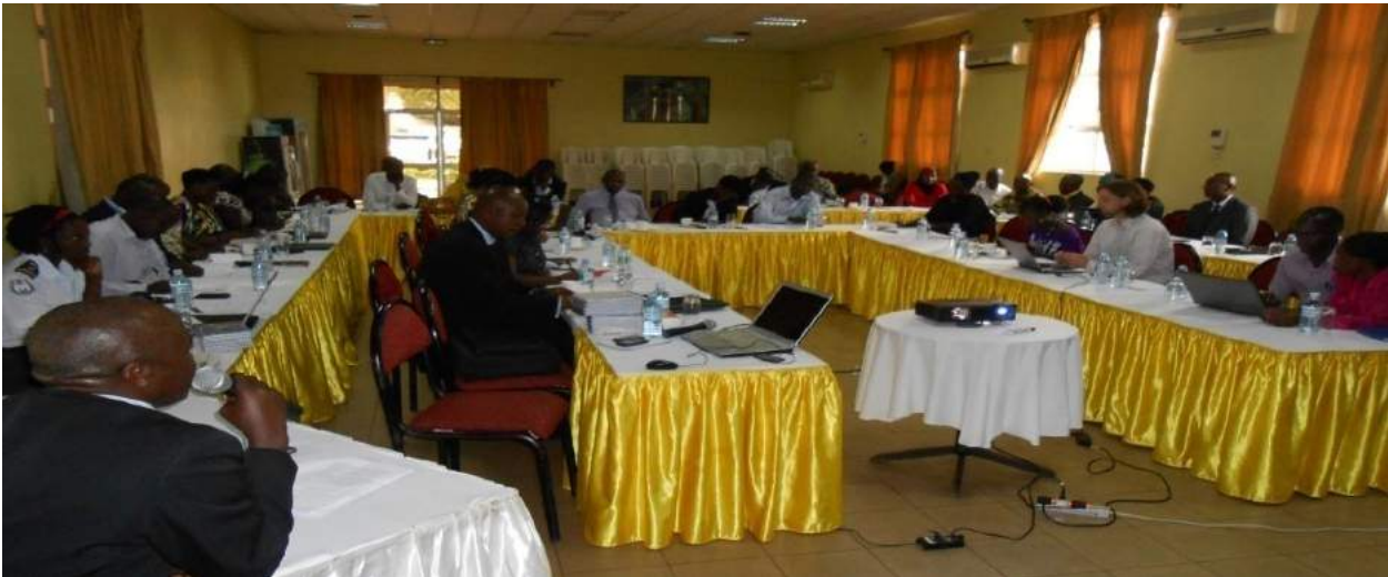
The National Task Force during one of the Consultation Meetings for Development of the NAP Minister for Internal Affairs, Gen Aronda Nyakairima during a Validation Meeting with the Task Force Members